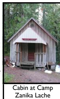
Cabin at Camp Zanika Lache

Solomon's Porch who are giving up their weekend to be cabin staff, cooks, etc. If you're interested in donating towards this retreat, please contact our office.