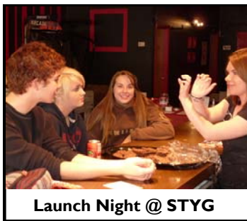
Launch Night @ STYG

Thanks to Applets & Cotlets for donating our "Turkish Delight."